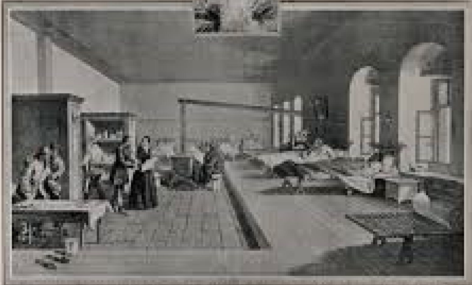
MISS FLORENCE NIGHTINGALE AT THE BRITISH HOSPITAL IN LONDON AND A SCENE OUTSIDE OF THE HOSPITAL. LAST IS THE N. W. OF THE HOSPITAL THAT IS THE ...

HER SPECIAL SERVICES TO THE CAUSE OF NURSING WERE RECOGNIZED ON MONDAY BY THE BARRONS OF THE PRESENTATION OF THE FREEDOM OF THE CITY OF LONDON