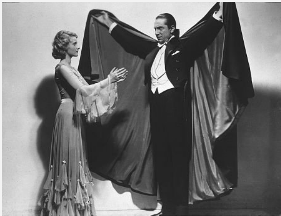
1930s Dracula film star Bela Lugosi