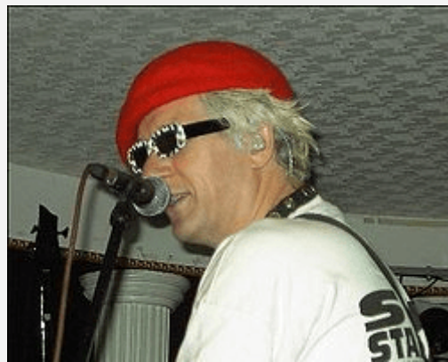
Captain Sensible with trademark red beret and glasses, pictured in 2006

Following the departure of Captain Sensible, lead singer Dave Vanian, who was born in Hemel Hempstead in Hertfordshire took the band in the direction of gothic rock. Influencing the style of the goth subgroup. In 1976 the music magazine NME stated that Vanian “resembles a runaway from the Addams Family”. Vanian, a name derived from ‘Transylvanian’, adopted an on and off-stage fashion style that some compared to a vampire from classic horror films. You can see the obvious comparisons on the pictures below. It is amazing to think that on an October Wednesday in 1982, in some of its final days, The Regal played host to a band that in its own way shaped music history. Hitchin caught a glimpse of the emergence of Punk and Goth and the beginnings of their music and fashions that continue to endure worldwide.