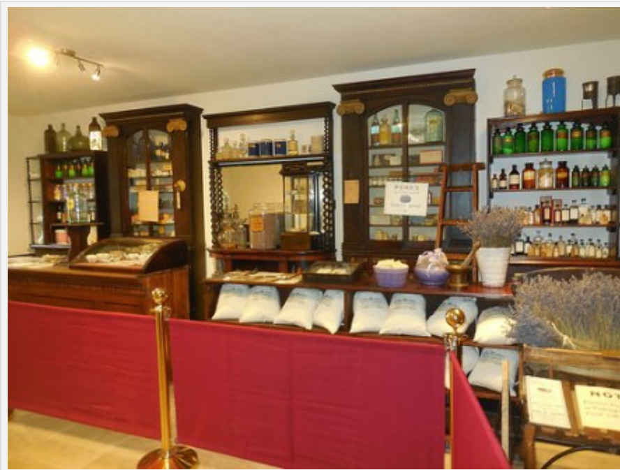
Perks and Llewellyn fittings re-installed at Hitchin Lavender, Ickleford

As some of you may have heard, museum staff have had to move out of our office, Learning Centre and Local Studies Centre as we have had our right of occupancy terminated by Hitchin Town Hall Ltd. We all hope that this is a temporary arrangement. In the meantime we are progressing with the museum fit-out, and aim to open the new museum in stages; we will update the blog once there is anything further to report.