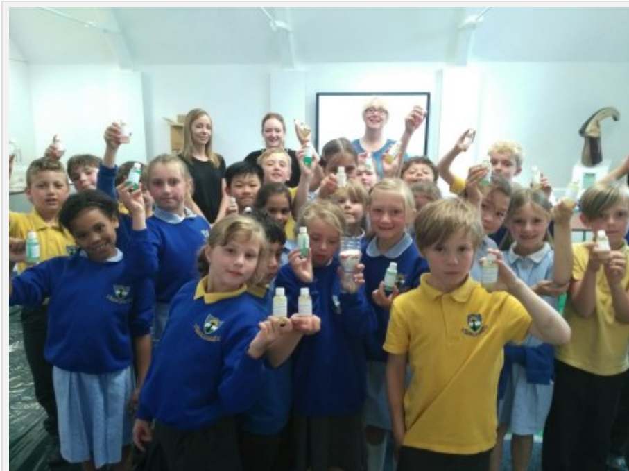
Children from Whitehill School in the Learning Centre, with the bubble bath they made in a science project here