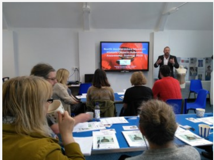
Asbestos awareness training in the Learning Centre

We've been busy making sure that we are all up to date with the training we need to run the new museum, and so that staff can also act as Duty Managers for the Town Hall. The curators are now Fire Marshalls and fully-trained St John's First Aiders, and all staff received dementia awareness training. We also hosted a training day on Asbestos Awareness for local museum staff, as a surprising number of museum objects, particularly 20 th century social history items, were made from or include asbestos – the indestructible wonder material of its day. Unexpected things like shoes or toys may contain asbestos, so we have been going through all the collections with a standard risk-assessment checklist, and have found a few items which have been stabilised.