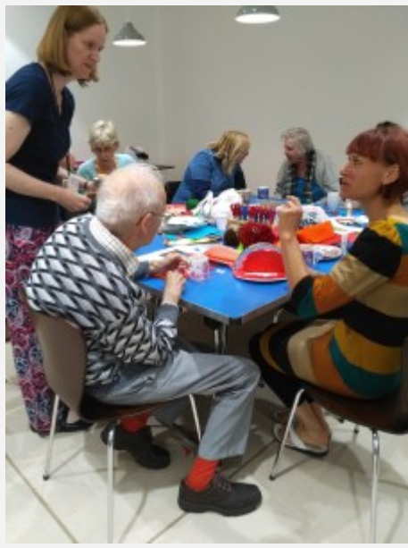
One of craft sessions for people with dementia and their carers

We've been busy making sure that we are all up to date with the training we need to run the new museum, and so that staff can also act as Duty Managers for the Town Hall. The curators are now Fire Marshalls and fully-trained St John's First Aiders, and all staff received dementia awareness training. We also hosted a training day on Asbestos Awareness for local museum staff, as a surprising number of museum objects, particularly 20 th century social history items, were made from or include asbestos – the indestructible wonder material of its day. Unexpected things like shoes or toys may contain asbestos, so we have been going through all the collections with a standard risk-assessment checklist, and have found a few items which have been stabilised.