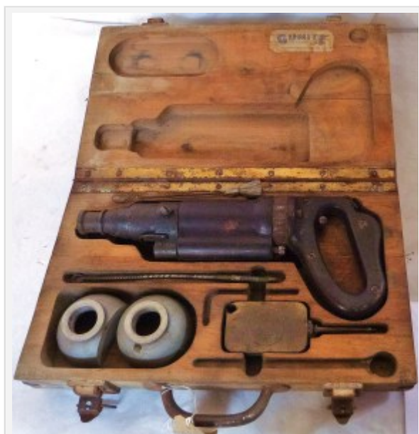
Fig IV Spring-gun

We also have some examples of spring-guns (Fig IV) which were more widely used as they covered a larger area, again there are two types; one potentially deadly and one humane. They worked by having a series of wires stretched at right angles which were attached to the gun, and so when the unfortunate person came across them and knocked one of the wires the gun would spin around to the wire which is now slack and would fire. The humane version did not contain live bullets, although they would still have the potential to injure!