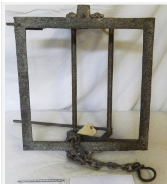
Fig III Humane Man-trap

We also have some examples of spring-guns (Fig IV) which were more widely used as they covered a larger area, again there are two types; one potentially deadly and one humane. They worked by having a series of wires stretched at right angles which were attached to the gun, and so when the unfortunate person came across them and knocked one of the wires the gun would spin around to the wire which is now slack and would fire. The humane version did not contain live bullets, although they would still have the potential to injure!