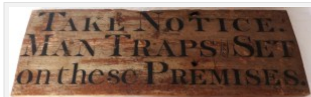
Fig I A notice of man-traps

Man-traps first came into use in England during the late eighteenth century. The law permitting the use of man traps can be explained by the fact it was near impossible to protect game without some kind of aid. The use of man-traps and spring-guns was not completely inhumane as land owners were obliged to give notice (Fig I) that there were traps set in order to prevent poaching; unfortunately this did not always deter poachers. (See Fig II for our example of an inhumane man-trap, I am 5'3 and the trap is nearly as tall as me, so it is awful to imagine someone being trapped in this trap!).