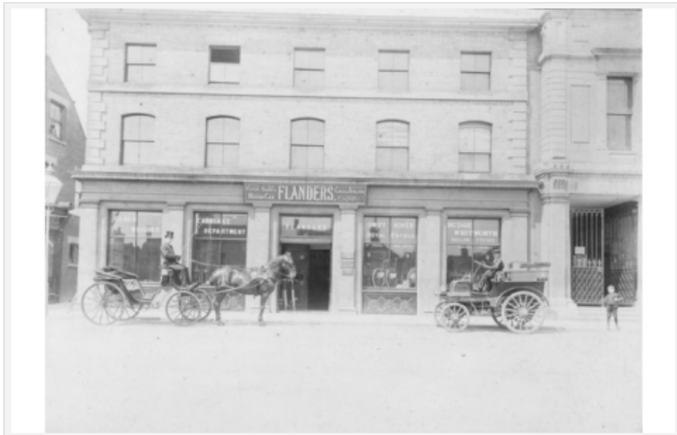
A horse drawn carriage and early motor car in Market Place about 1902