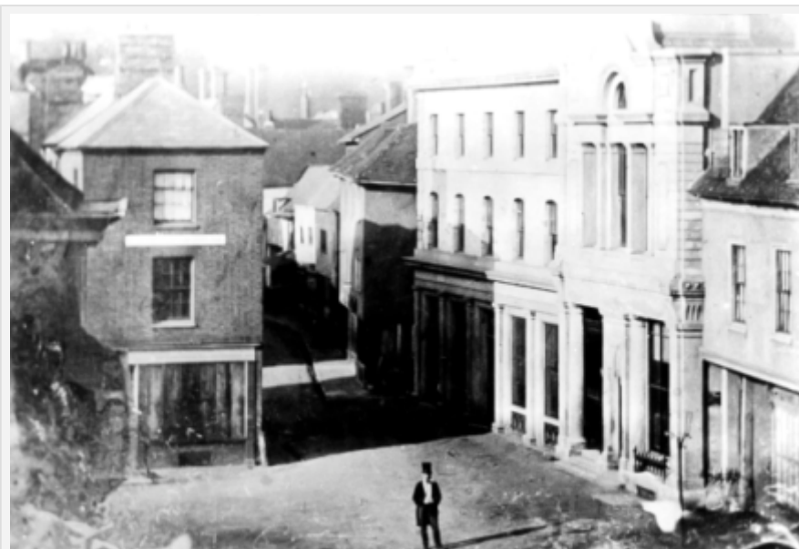
Our earliest photograph, showing Market Place in 1854