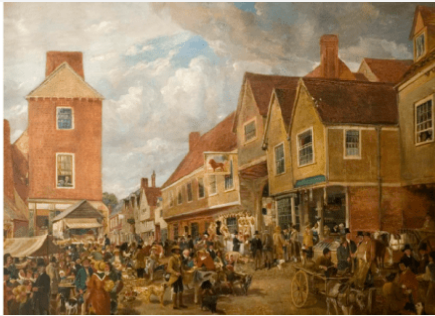
Samuel Lucas Sr's Market Place painting, 1841

A favourite theme of mine was the section showing momentous local moments. This section includes the oldest photo from our collection which I mentioned earlier. This features the building on the left, The Shambles, and the Corn Exchange (now Pitcher and Piano) on the right: a recognisable sight alongside a Hitchin of the past! The Shambles features on Samuel Lucas Snr's Market Place painting. The photo is made even more interesting by the painting, which is on display in the museum. It also features on the mural as one of the few images that is not a photo! In the Lucas painting, you see different buildings on the right. These were demolished to make way for the Corn Exchange, with the owners of the Corn Exchange later demolishing the Shambles. The painting and the photo are just thirteen years apart!