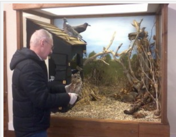
Emptying the cases

North Herts Museum staff have been busy down at Standalone Farm. If you haven't already seen, there is a barn at the farm with some interesting nature displays, giving visitors a chance to get a close look at some creatures they may not normally see. These include some North Herts Museum cases with large creepy crawlies and an impressive seascape diorama with a huge variety of bird specimens. There is also a working beehive with live bees who